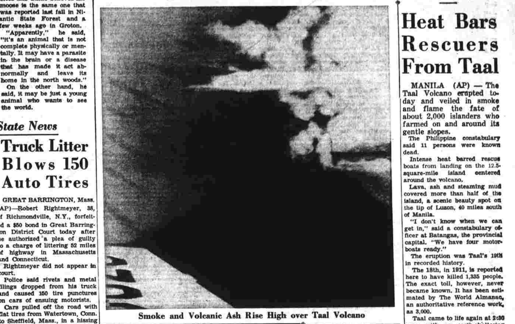
Smoke and Volcanic Ash Rise High over Taal Volcano